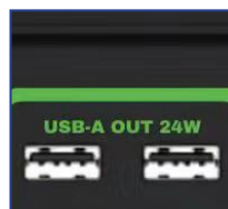
Type A USB output port