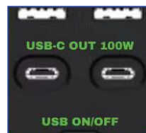
Type C USB output port