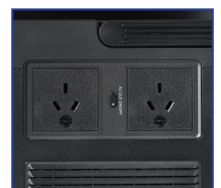
AC output switch socket