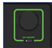
Car charger output port